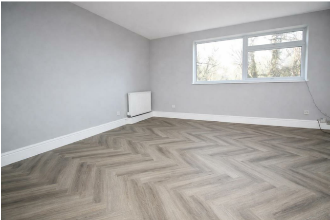
Living room 14'9" x 13'5" (4.50m x 4.09m )