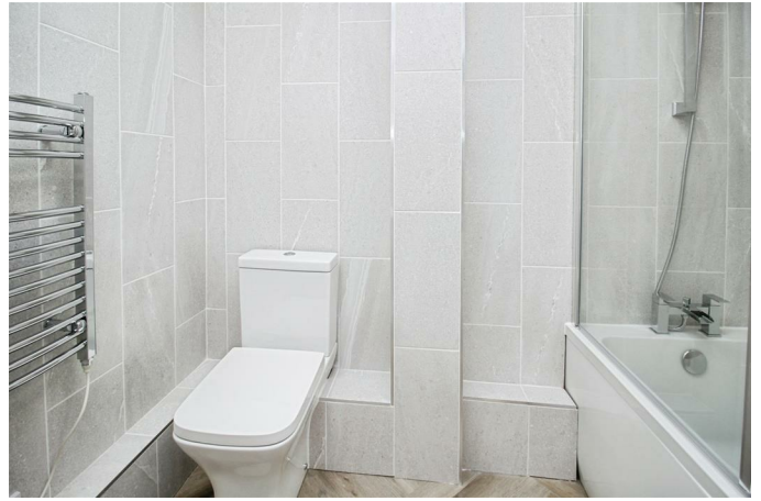
Bathroom 7'7" x 5'10" (2.31m x 1.78m)