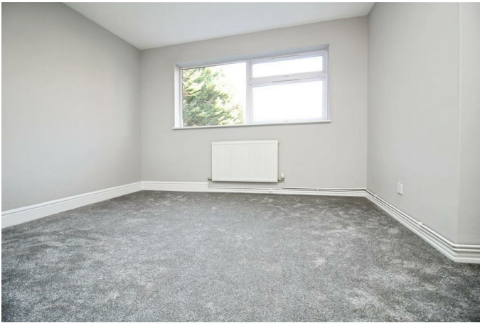
Bedroom 1 13'9" x 13'5" (4.20 x 4.10)