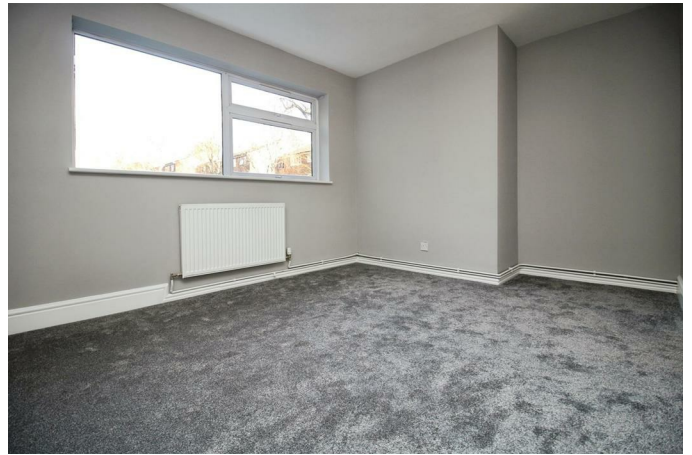
Bedroom 2 13'5" x 11'6" (4.09m x 3.51m)